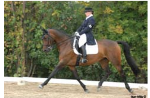
Lone Oak Equine Photography