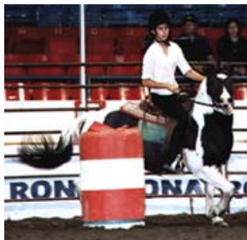
Lone Oak Equine Photography

Nylon Halter and Lead navajo pattern $15.95