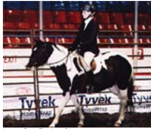
Lone Oak Equine Photography

Submit your free 25 word Shows & Clinics listing to Wilton Tack. e-mail: info@wiltontack.com fax: 613-386-5632 Check out our web site www.wiltontack.com for up to date listings of Shows & Clinics