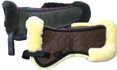
Sheepskin Half-Pad Natural or Black

Free of harmful residues, Christ® lambskin products are made from the finest Australian Merino lambskin to the highest specifications. Lambskins promote circulation, are temperature balancing, reduce saddle pressure and prevent the development of sores.