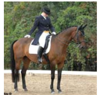
Lone Oak Equine Photography