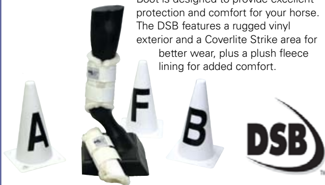
Equest Dressage Sport Boot Dressage Cones

The Equest DSB Dressage Sport Boot is designed to provide excellent protection and comfort for your horse. The DSB features a rugged vinyl exterior and a Coverlite Strike area for better wear, plus a plush fleece lining for added comfort.